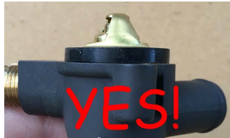
Figure 2: Improperly indexed thermostat Will not seat properly.