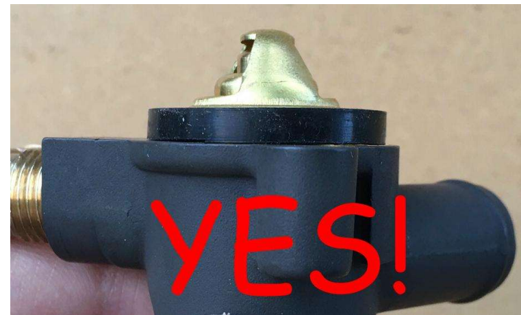
Figure 6: Improperly indexed thermostat Will not seat properly.