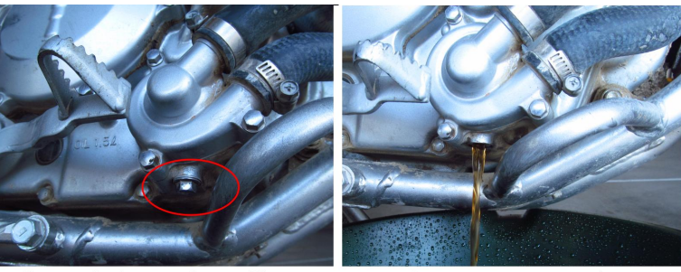
Figure 2. Locate Drain Plug.

3) Drain the coolant into a suitable container, remembering to keep it away from children and pets due to the toxicity. The drain plug (10mm head) is in bottom of the coolant pump housing as shown in Figures 2 and 3 . Approximately 33 fluid ounces of coolant will drain. Reinstall the drain plug with its sealing washer, and torque to 60 to 70 <u>inch-pounds</u> (that's only 5.0 to 5.7 ft-lb).