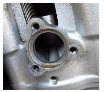
Figure 7A. Remove Original Thermostat.