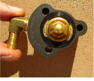
Figure 8. Install Thermo-Bob 2 thermostat in Thermo-Bob 2 Housing.

6) Install the supplied thermostat into the Thermo-Bob 2 housing as shown in Figure 8 . Slide the bypass hose onto the brass fitting that is part of the Thermo-Bob 2, and install a small clamp (supplied) and tighten. (Orient the clamp as shown in Figure 4).