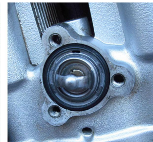
Figure 7. Original Thermostat.